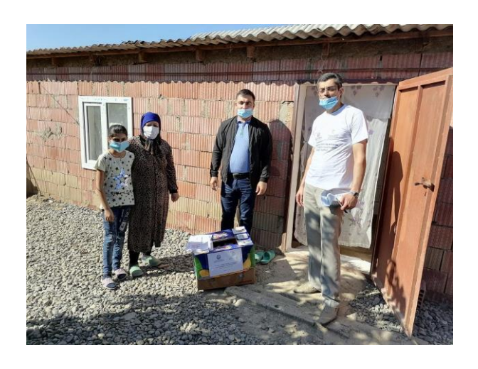
Press Secretary of EPSAYA public union December 30, 2020 year